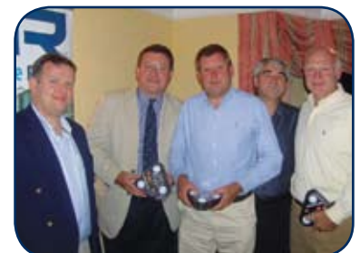
□ L&T Golf Day Hanbury Manor Winning team