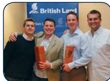
□ British Land Annual Golf Day Winning team