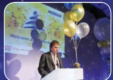
■ John Inverdale - Christmas 2007