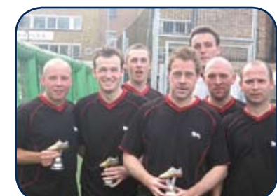
□ Wilkinson Williams 5 aside Football match