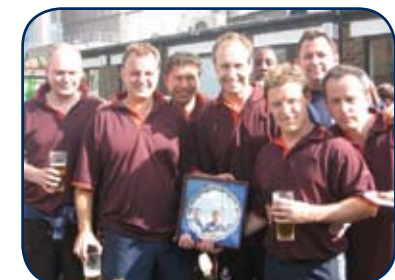
□ Wilkinson Williams 5 aside Football match